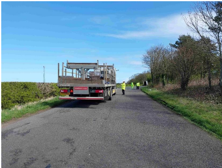
Vehicle checks at Burnmouth

On 17 th April, Roads Policing officers, in partnership with the Community Action Team, Community Policing Team and Motorcycle Unit ran an operation on the A1 at Burnmouth. Our partners from Driver and Vehicle Standards Agency, Traffic Examiners and HM Revenue and Customs were also present. The aim was to carry out numerous checks of vehicles to ensure they are fit for use on the roads and ensure legislation is complied with. 73 vehicles were stopped, 9 offences dealt with, and numerous warnings issued.